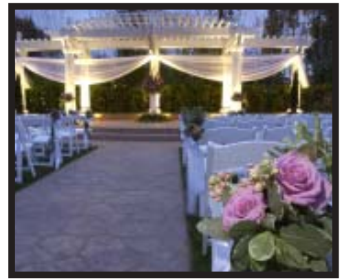
Our new outdoor Terrace Garden can accommodate up to 400 guests.

Your wedding and the Handlery; a marriage made in heaven! Our newest addition, the outdoor Terrace Garden, awaits your guests with a whole new fresh feeling — feel close to nature and the beauty of San Diego. Indoors or out, our wedding professionals give your occasion the unique Handlery family touch, where memories are made.