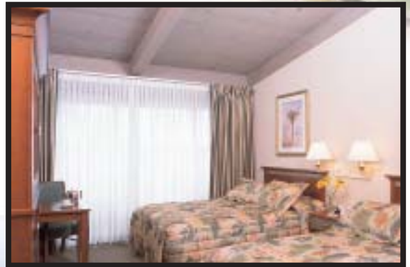
Our beautifully decorated guestrooms feature custom furniture, refrigerators and Internet access.

Welcome to the Handlery Hotel and Resort, your San Diego retreat for business and pleasure. We invite you to relax and unwind in our spacious rooms, with all the comforts of home.